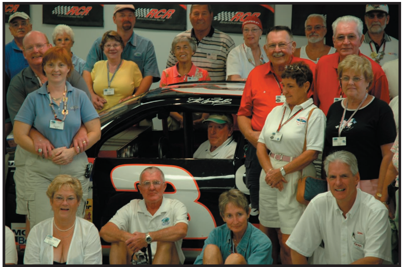
Members gather at the Gearhead Session