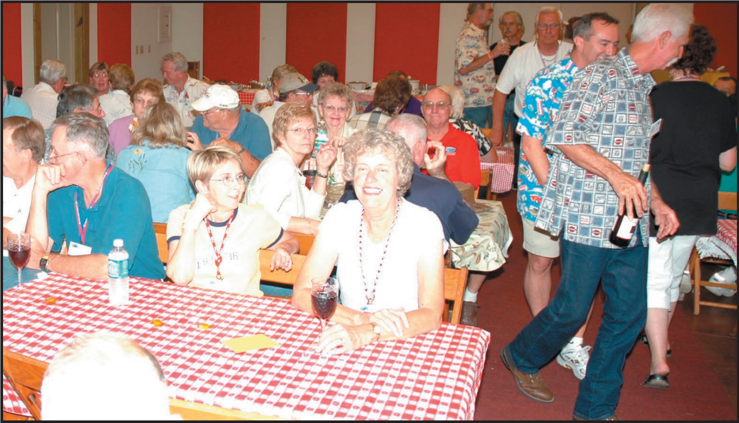
Happy Hour event in the Music Barn