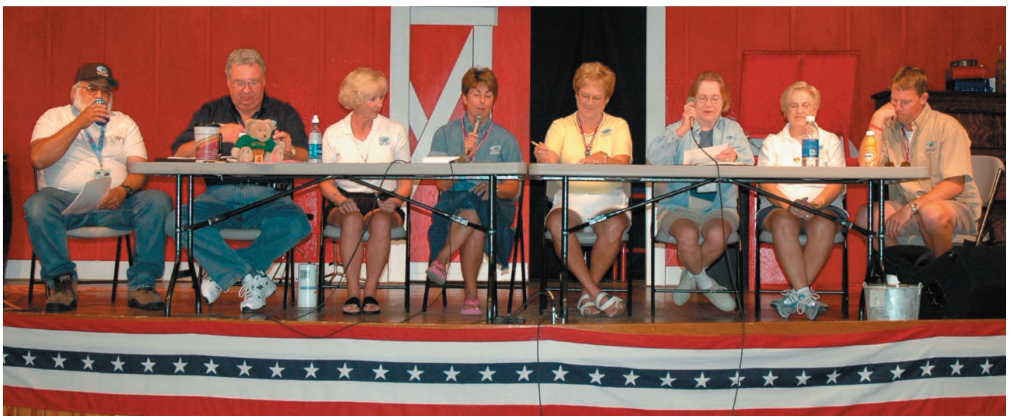
New Alpine Coach Association Board of Directors

It's always nice to see old friends and welcome new members. We look forward to seeing everyone again in Nashville in October.