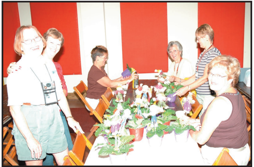
Volunteers getting ready for the first evening