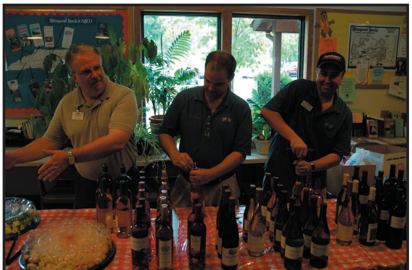
The guys from Guaranty RV at the wine and cheese party