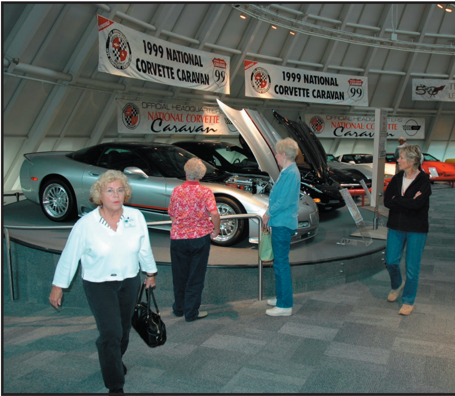
There's a "ladies ride" if I ever saw one!

Please send your rally photos (with captions) for inclusion in the online edition of the ACA Newsletter. Photos should be sent as jpg or tif files to aca_newsletter@yahoo.com .