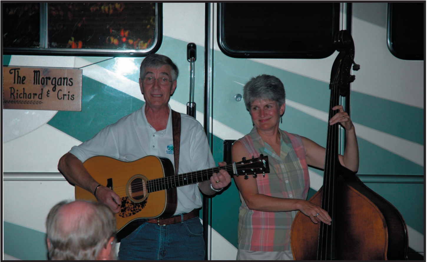
An Evening Serenade