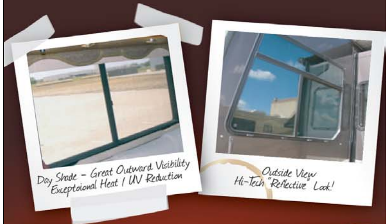
Day Shade - Great Outward Visibility Exceptional Heat / UV Reduction

ACA MEMBERS - Please remember to support our advertisers, they help make our newsletter possible.