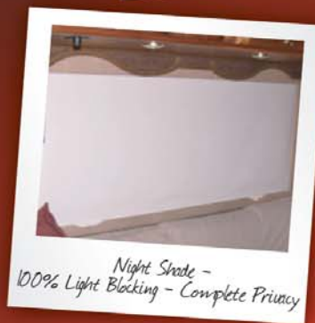
Night Shade - 100% Light Blocking - Complete Privacy