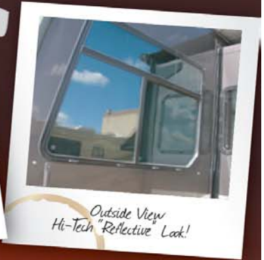
Outside View Hi-Tech ™ Reflective Look!