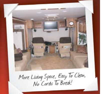
More Living Space, Easy To Clean, No Cords To Break!